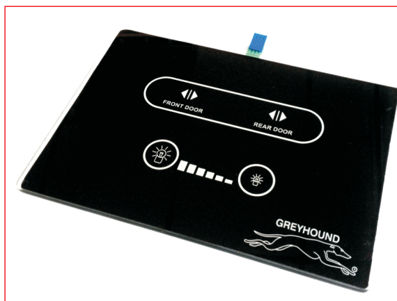
Domotic and automobile