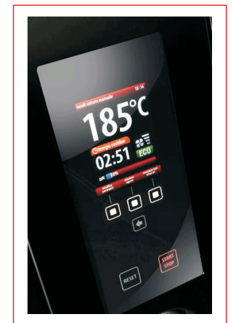
Food and beverage